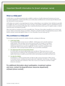
Employee notification flier (VC 22087)

then: Step 1: Update universal availability of your plan